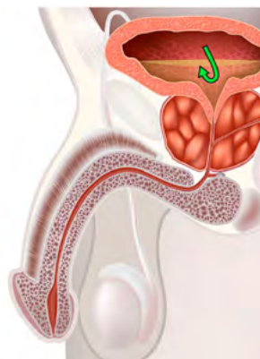
Enlarged prostate (BPH)

Diagnosis requires three actions: During a digital transrectal examination, the urologist checks the size of the prostate with his finger via the anus. The prostate is then visually displayed using a transrectal ultrasound while the volume is simultaneously calculated by a computer. Finally, an urine examination is carried out and the PSA - a blood parameter used to diagnose prostate carcinoma (malignant tumor of the prostate) - is measured.