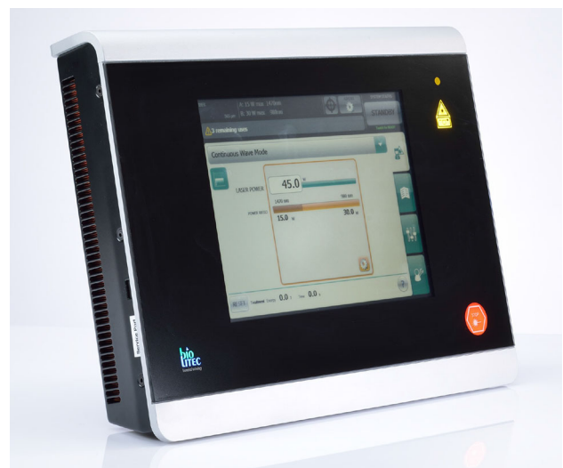
Fig. 1 Leonardo DUAL 45 ® diode laser from Biolitec AG, Germany. Wavelength 980–1470 nm. Maximum energy 15 Watts

The laser probe was inserted through the perineal fistula opening using either a “Ceralas ® ” (or more recently, a “Leonardo DUAL 45 ® ”) diode laser (Biolitec AG, Germany). This type of laser delivers energy at a wavelength of 1470 nm (Fig. 1) providing an optimal absorption curve in water which is considered to result in a more efficient local tissue shrinkage and protein denaturation. When there is no longer any water in the tissue and the temperature exceeds 100 °C, a white smoke vaporization effect is observed. The use of this wavelength by the radial-tip laser fibre permits destruction of the granulation and epithelial tissue causing a 2- to 3-mm zone of controlled tissue damage with less power (13 W) and a diminished likelihood of perifistular collateral